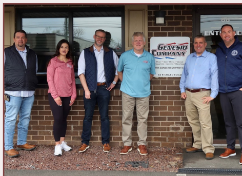
I had the opportunity to visit Genesio Company, a HVAC prefabrication company located in Ivyland. I will be reintroducing legislation in the near future that would ensure offsite custom fabrication on public projects is covered under existing PA law.