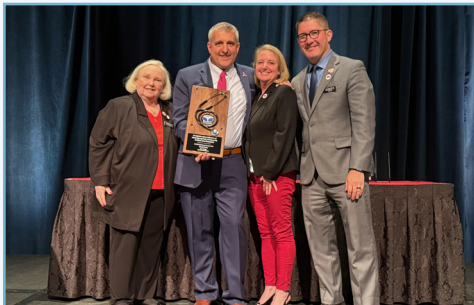
I was honored to receive the 2025 Healthcare Champion Award presented by the Pennsylvania Association of Staff Nurses & Allied Professionals (PASNAP) for my advocacy for frontline nurses and healthcare professionals and the vulnerable populations they care for.