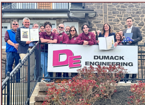
Dumack Engineering, a Pennsylvania Certified Small Business in Richboro celebrated 60 years in business last year.